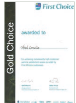
FIRST CHOICE – GOLD CHOICE