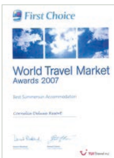
FIRST CHOICE – WORLD TRAVEL MARKET AWARDS