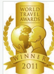
WTA – Europe's Leading Golf Resort