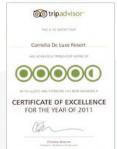
TRIPADVISOR – CERTIFICATE OF EXCELLENCE