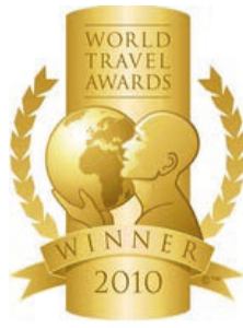
WTA – Europe's Leading Golf Resort