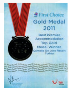
FIRST CHOICE – TOP GOLD MEDAL