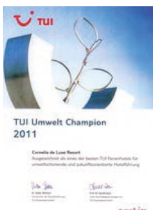
TUI – UMWELT CHAMPION