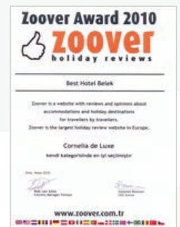
ZOOVER – BEST HOTEL BELEK