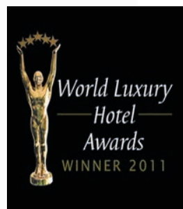
BEST LUXURY COASTAL RESORT