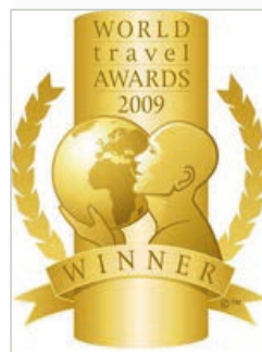
WTA – Turkey's Leading Golf Resort