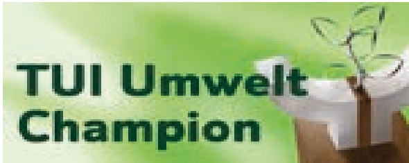
TUI – Environmentally Friendly TOP 100 Hotels Worldwide