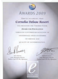
THOMAS COOK - AWARDS for EXCELLENCE