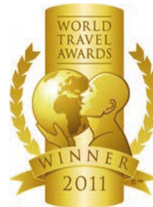
WTA – Turkey's Leading Golf Resort