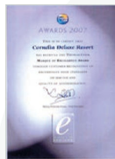
THOMAS COOK - MARQUE of EXCELLENCE